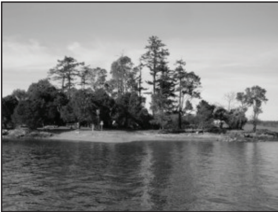
Spit at south end of island